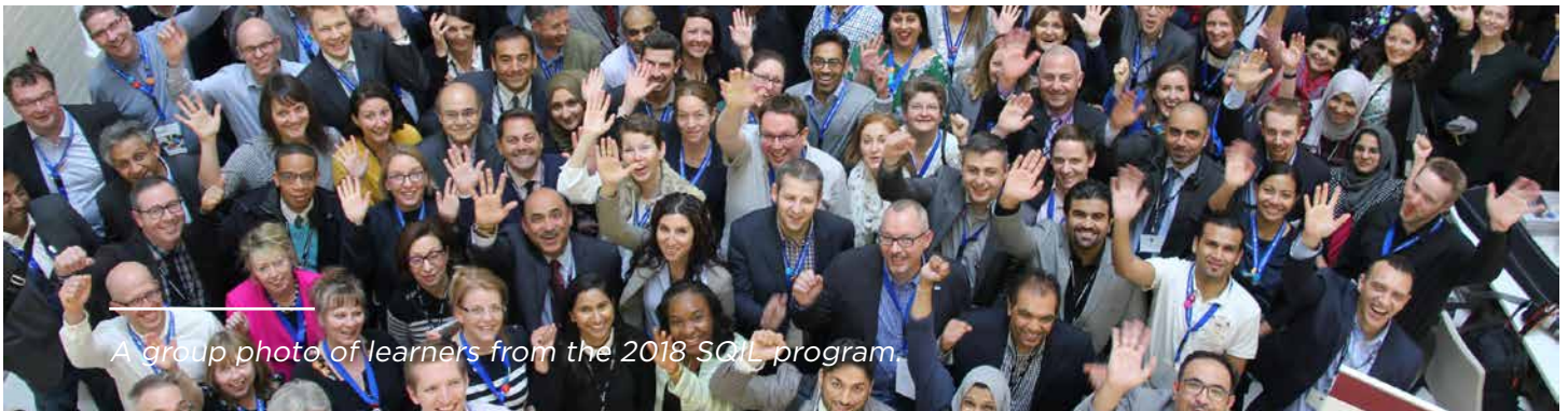
A group photo of learners from the 2018 SQIL program.

Learn more about the SQIL program on the web at hms.harvard.edu/sqil